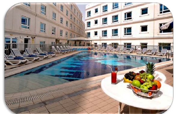
Accessible Swimming Pool