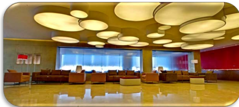
Free Internet in the Lobby