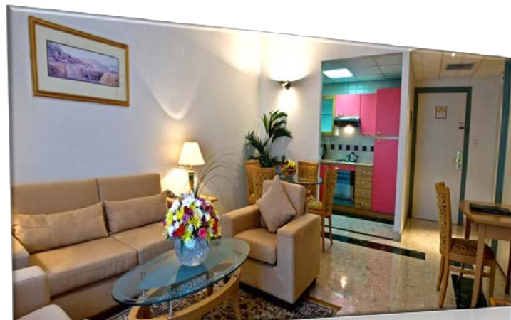
Apartment “Triple room” (1 single room + 1 double room and 2 bathrooms).