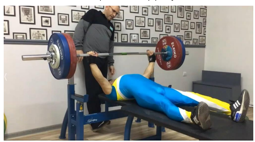
Example camera recording view